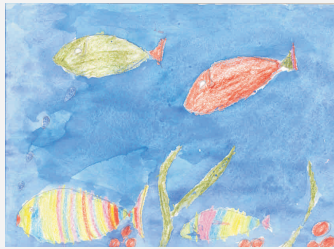
Harshul K Aushal